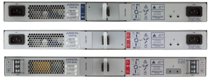
Arista 7010T Rear View - reversible airflow, AC & DC