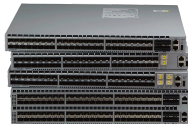
Arista 7050SX Series of 1/10GbE and 10/40GbE Switches Top to bottom: 7050SX-64, 7050SX-72, 7050SX-128, 7050SX-96

Combined with Arista EOS the 7050X Series delivers advanced features for big data, cloud, virtualized and traditional designs.