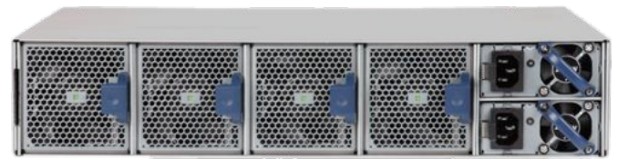
Arista 7050X 2RU Rear View: Rear-to-front airflow model (blue)