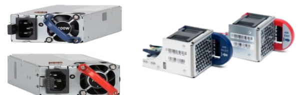
Hot swap and reversible power supply and fan modules