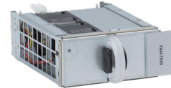
Arista 7010T hot swap and reversible fan module