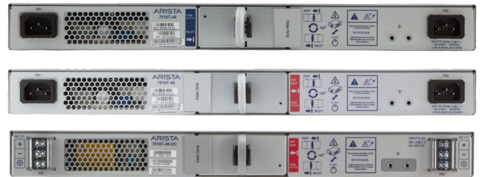
Arista 7010T Rear View - reversible airflow, AC & DC