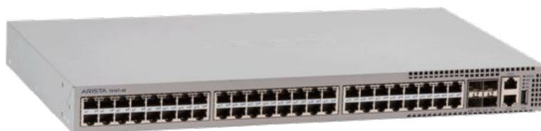
Arista 7010T-48: 48 port 10/100/1000 and 4 port 10GbE Switch

Consuming under 52W the 7010T are extremely power efficient at less than 1W per port. Built in power redundancy and customer reversible redundant fans allows cooling airflow in either forward or reverse direction in a single system.