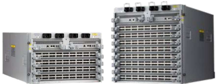
Arista 7500E Series Modular Data Center Switches

With front-to-rear airflow, redundant and hot swappable supervisor, power, fabric and cooling modules the system is purpose built for data centers. The 7500E Series is energy efficient with typical power consumption of under 4 watts per port for a fully loaded chassis. All of these attributes make the Arista 7500E an ideal platform for building reliable, low latency, resilient and highly scalable data center networks.