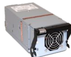
Arista 7500 Series Power Supply