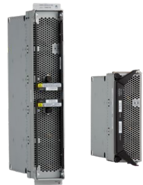
Arista 7500 Series Fabric Modules