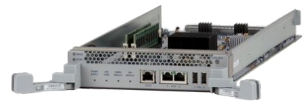
Arista 7500 Series Supervisor