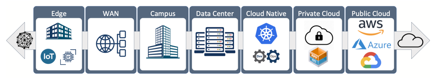
Figure 1: Universal Cloud Network - Consistent in every Place in the Cloud

Further, the confluence of multi cloud deployments with emerging cloud native Kubernetes and service mesh architectures, with their inherent dynamic scaling and high velocity virtualization, ephemeral addressing, and elasticity creates an environment that breaks most traditional networking and security architectures.